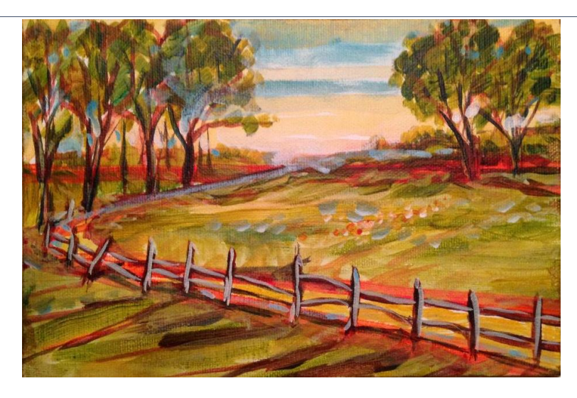
\mbox{\sc Hand} painted original cards by Ann Bianchi. Sold single and ordered in multiples for events