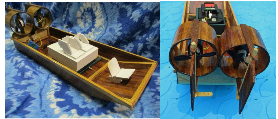
Airboat model with variable speed propellers made from scratch by Ian Sanderson