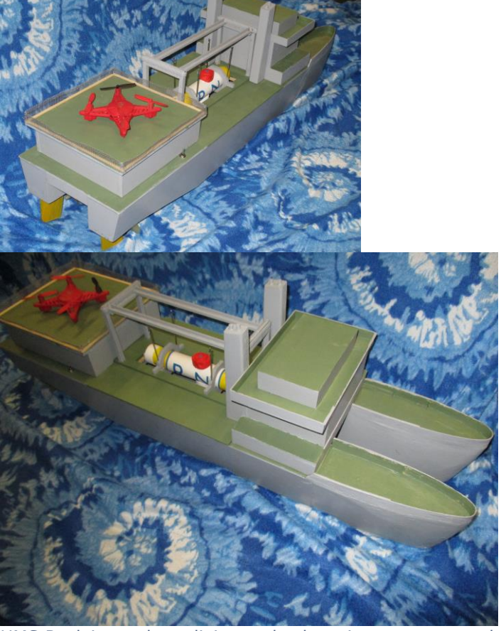
HMS Reclaim, a deep diving and submarine rescue vessel model made from scratch by Ian Sanderson