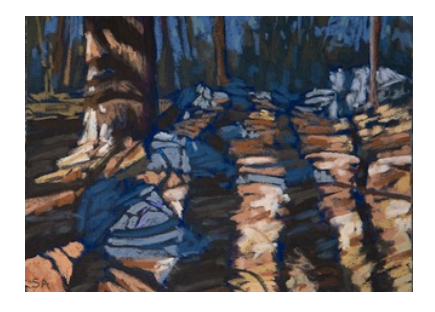
Pine Needles Morning, pastel