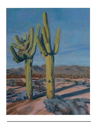
Saguaro Pair Arizona, oil